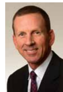
Hon Michael Wright, Minister for Racing